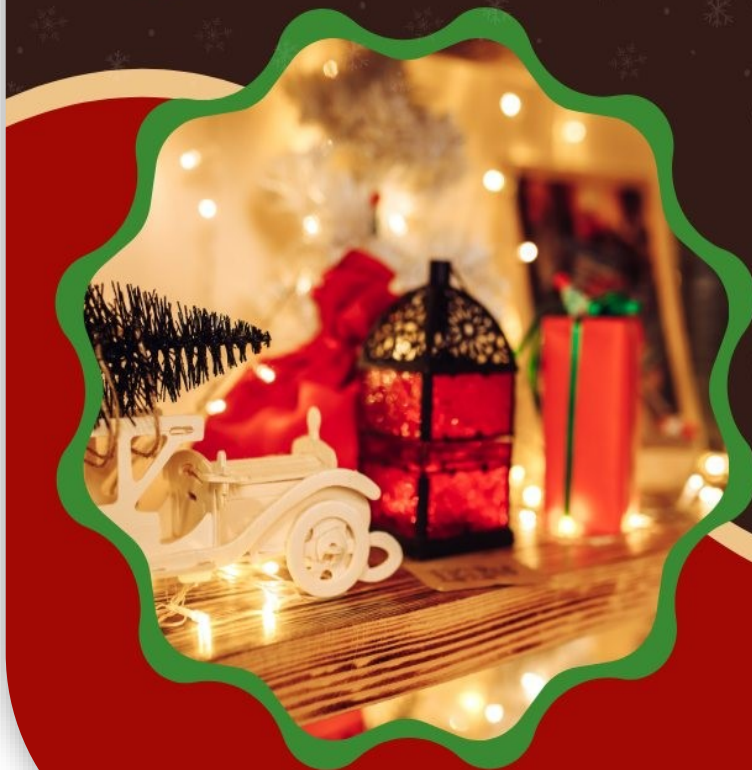
Table rental is by donation!

If you would like to book a table, please call us at the phone number below.