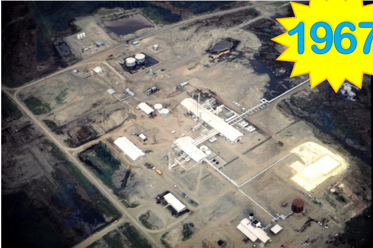
"Banff Oil (Aquitaine) Plant" 1967.

"In Feb. 1965 the Banff-Aquitaine Rainbow 7-32-109-8 exploratory well discovered a 435-ft oil zone in Keg River reef." Last, G. J. Development of the Rainbow area. [Alberta]. United States: N.p., Web.